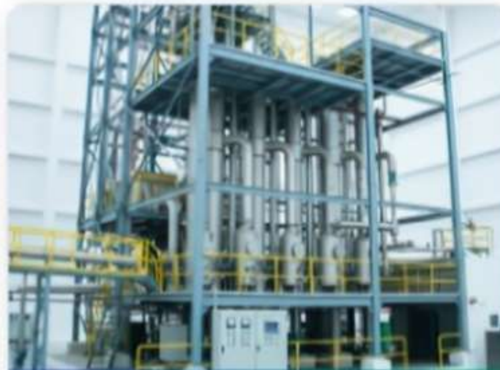
Solvent Recovery Plant