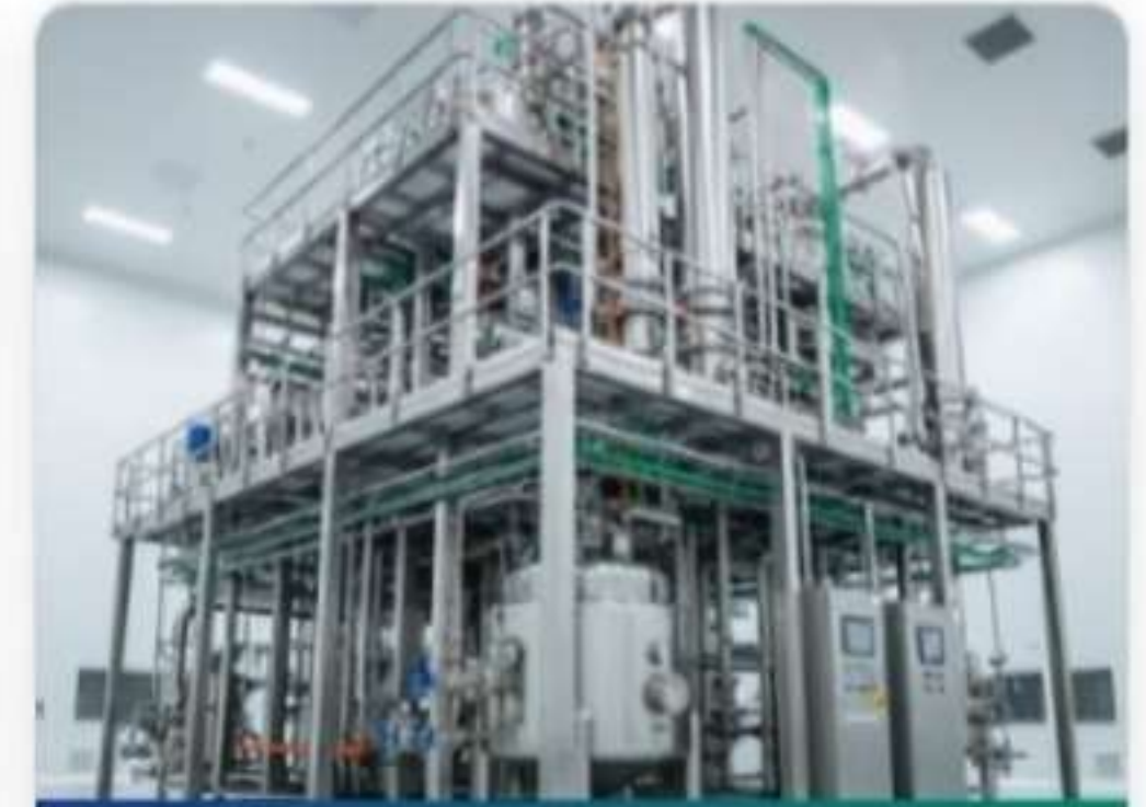
Essential Oil Extraction Plant