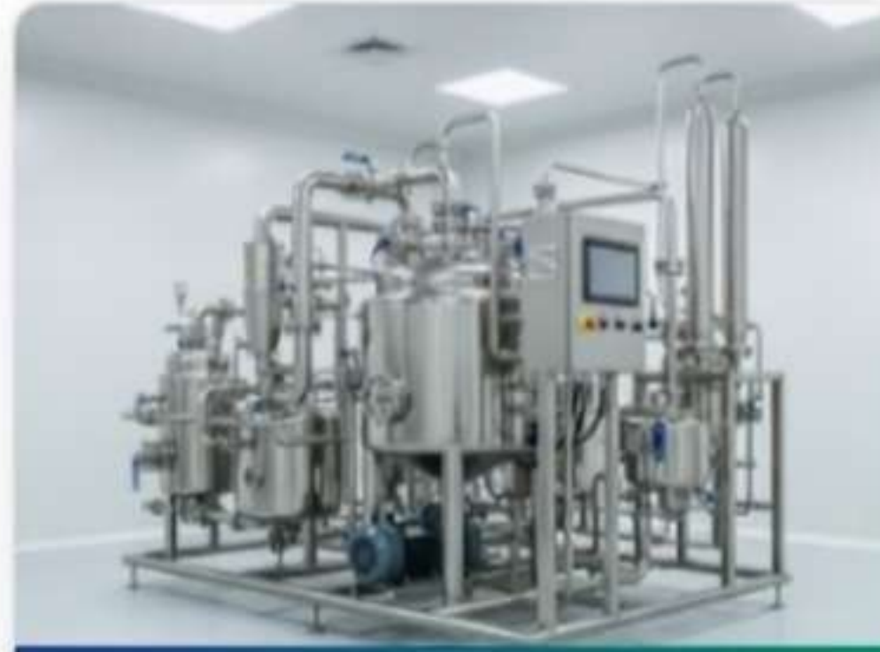
Herbal Extraction Plant