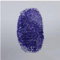
Left Thumb Impression

To view Marksheet of B. Pharm 2nd Year Click here.