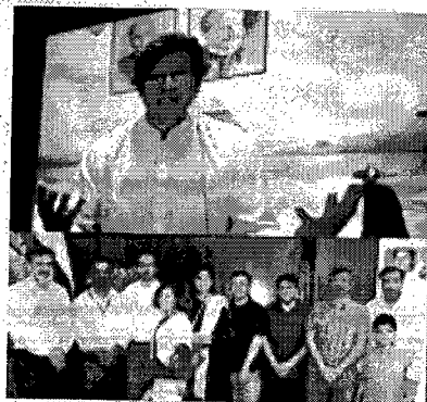
WORLDWIDE WEBINAR JALSA

PTI USA organized Imran Khan's LIVE Video address and a Questions & Answer session on June 11, 2011. This first ever Internet TownHall meeting / Jalsa was attended by hundreds of Pakistanis from around the world, while Imran Khan was addressing on Video from PTI's office in Islamabad. Attendees showed huge interest & asked wide variety of questions.