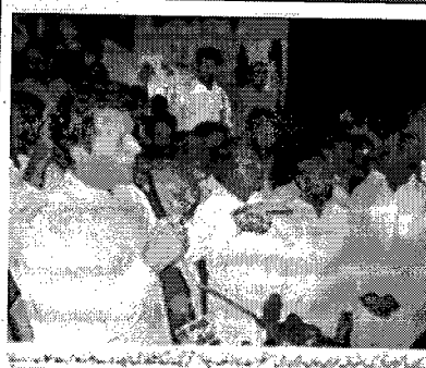
IMRAN KHAN INITIATING "HUKUMAT HATAO, MULK BACHAO" MOVEMENT IN MULTAN ON 06/25 ZARDARI & CO: GAME OVER