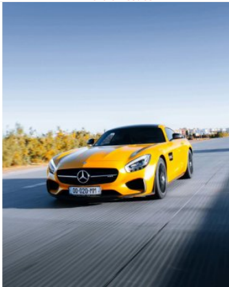
Photo of Issues