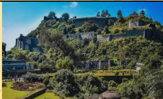
Kangra Fort, 5 Km

The Jayanti Mata Temple in Kangra is a Shakti Peeth dedicated to Goddess Durga, known for its significance in Hindu mythology and its historical connection to the Pandavas. Although often associated with Kangra, the main temple is located in Punjab's Jayanti Majri village, while the Kangra region has its own famous The Jayanti Mata Temple is believed to be a wish-fulfilling goddess and a kuldevi for the Pandavas