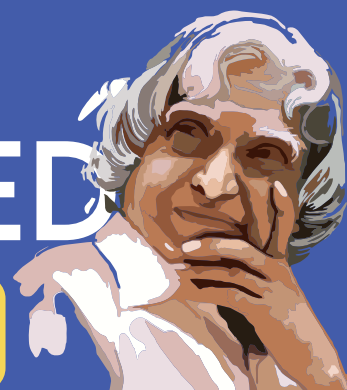
APJ ABDUL KALAM 11 TH PRESIDENT OF INDIA