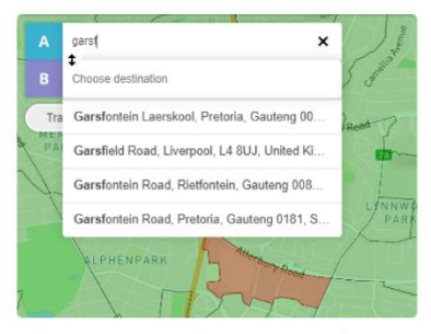
Home Screen (Navigate Tab)