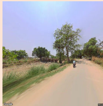
Location #7 | 100.96 km from start Kera Near: Shri Krishna Govardhan Mandir Kera