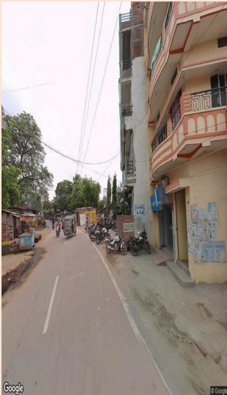
Location #4 | 1.9 km from start Maharani chowk, Fatwah Near: Dr Bhavya Homeopathic Clinic