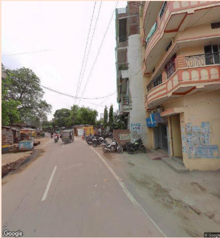
Location #4 | 1.9 km from start Maharani chowk, Fatwah Near: Dr Bhavya Homeopathic Clinic