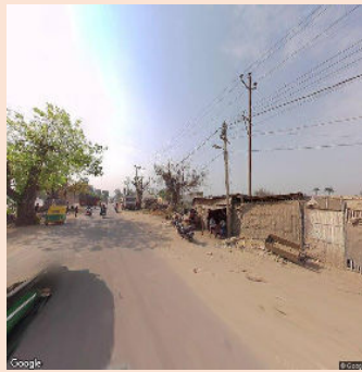
Location #6 | 8.95 km from start Fatuha Marg, Jaferkhantola Near: Jp Ganga Path Didarganj