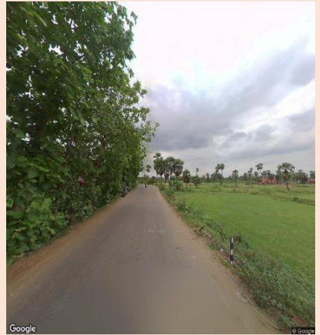
Location #6 | 19.49 km from start Sardar Ballabh Bhai Patel Marg, Hilsa Near: