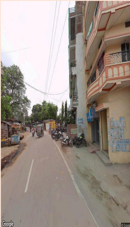
Location #4 | 1.9 km from start Maharani chowk, Fatwah Near: Dr Bhavya Homeopathic Clinic