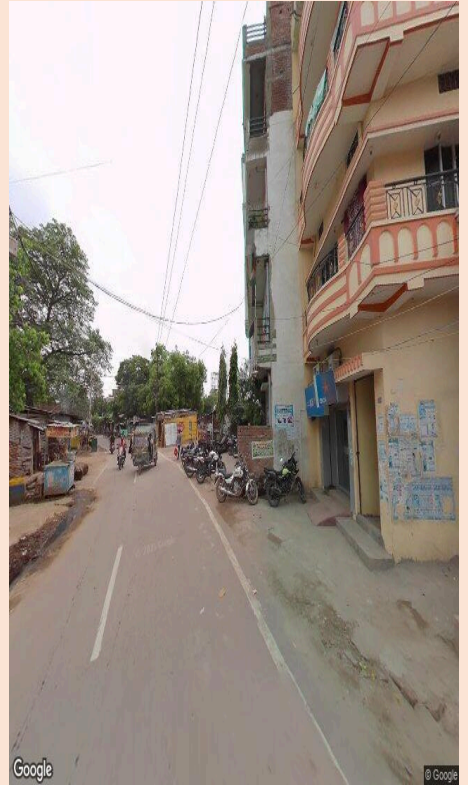
Location #3 | 1.9 km from start Maharani chowk, Fatwah Near: Dr Bhavya Homeopathic Clinic