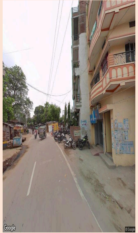
Location #3 | 1.9 km from start Maharani chowk, Fatwah Near: Dr Bhavya Homeopathic Clinic