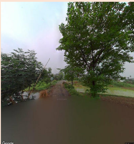
Location #7 | 19.43 km from start Sardar Ballabh Bhai Patel Marg, Hilsa Near: Dharmendra Pan Dukan