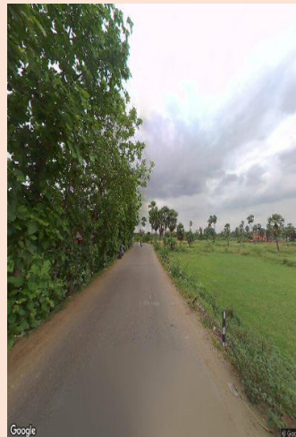
Location #7 | 19.49 km from start Sardar Ballabh Bhai Patel Marg, Hilsa Near: