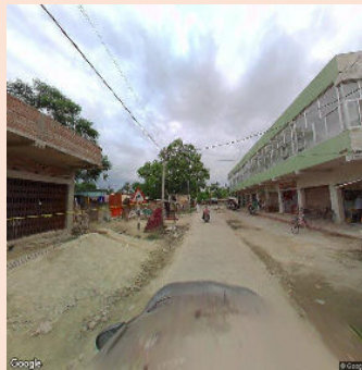
Location #10 | 55.83 km from start Kali Chowk, Kamrawan Near: Hindustan Petroleum Corporation Limited