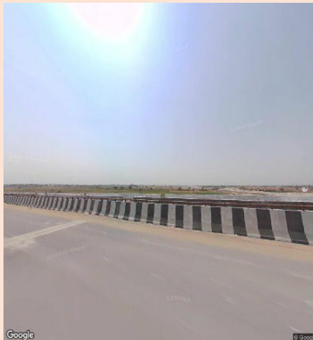
Location #5 | 21.92 km from start Dumari Near: Premium Jupiter Infratech And Service & PVT. LTD.