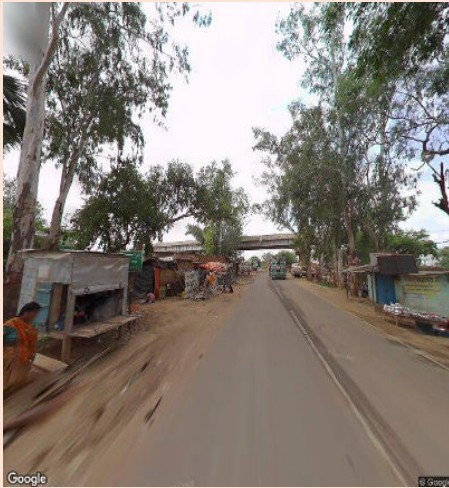
Location #4 | 8.38 km from start Daniawan Near: Annania Nursing Home