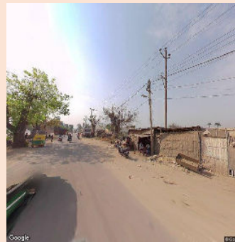
Location #7 | 8.95 km from start Fatuha Marg, Jaferkhantola Near: Jp Ganga Path Didarganj