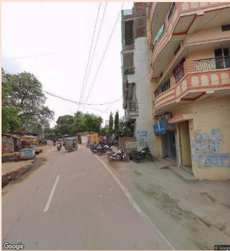
Location #4 | 1.9 km from start Maharani chowk, Fatwah Near: Dr Bhavya Homeopathic Clinic