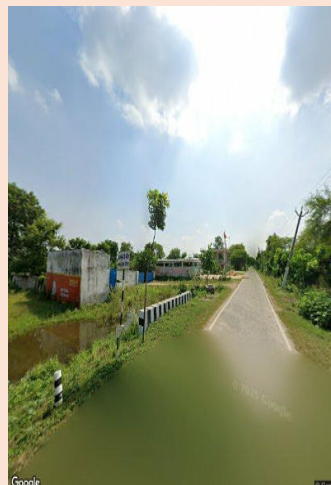
Location #11 | 106.02 km from start Sanha - Bakhda Road, Sanha-East Near: W.p.u sanha north, Hanuman Mandir Sanha Naya