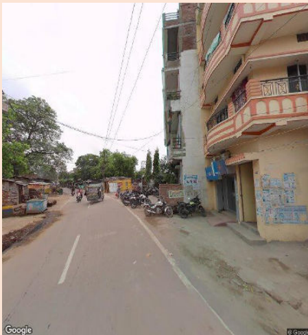
Location #4 | 1.9 km from start Maharani chowk, Fatwah Near: Dr Bhavya Homeopathic Clinic