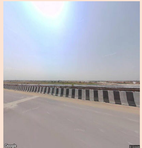
Location #6 | 21.92 km from start Dumari Near: Premium Jupiter Infratech And Service & PVT. LTD.