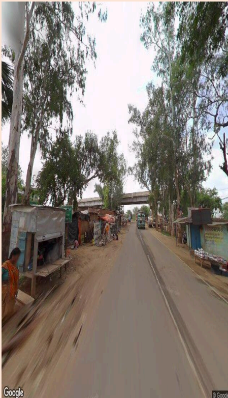
Location #4 | 8.38 km from start Daniawan Near: Annania Nursing Home