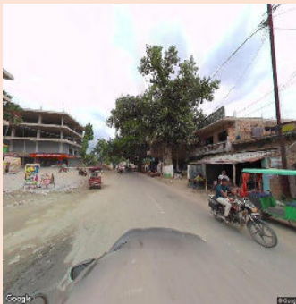
Location #9 | 55.65 km from start Kali Chowk, Sahbajpur Mahnaia Near: Hindustan Petroleum Corporation Limited