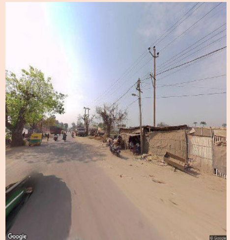
Location #6 | 8.95 km from start Fatuha Marg, Jaferkhantola Near: Jp Ganga Path Didarganj