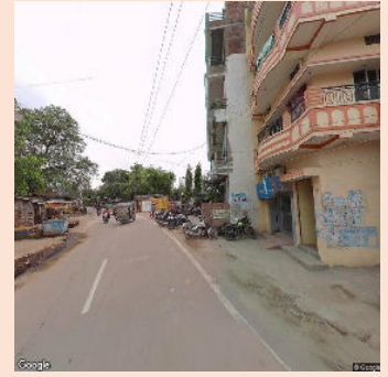
Location #4 | 1.9 km from start Maharani chowk, Fatwah Near: Dr Bhavya Homeopathic Clinic