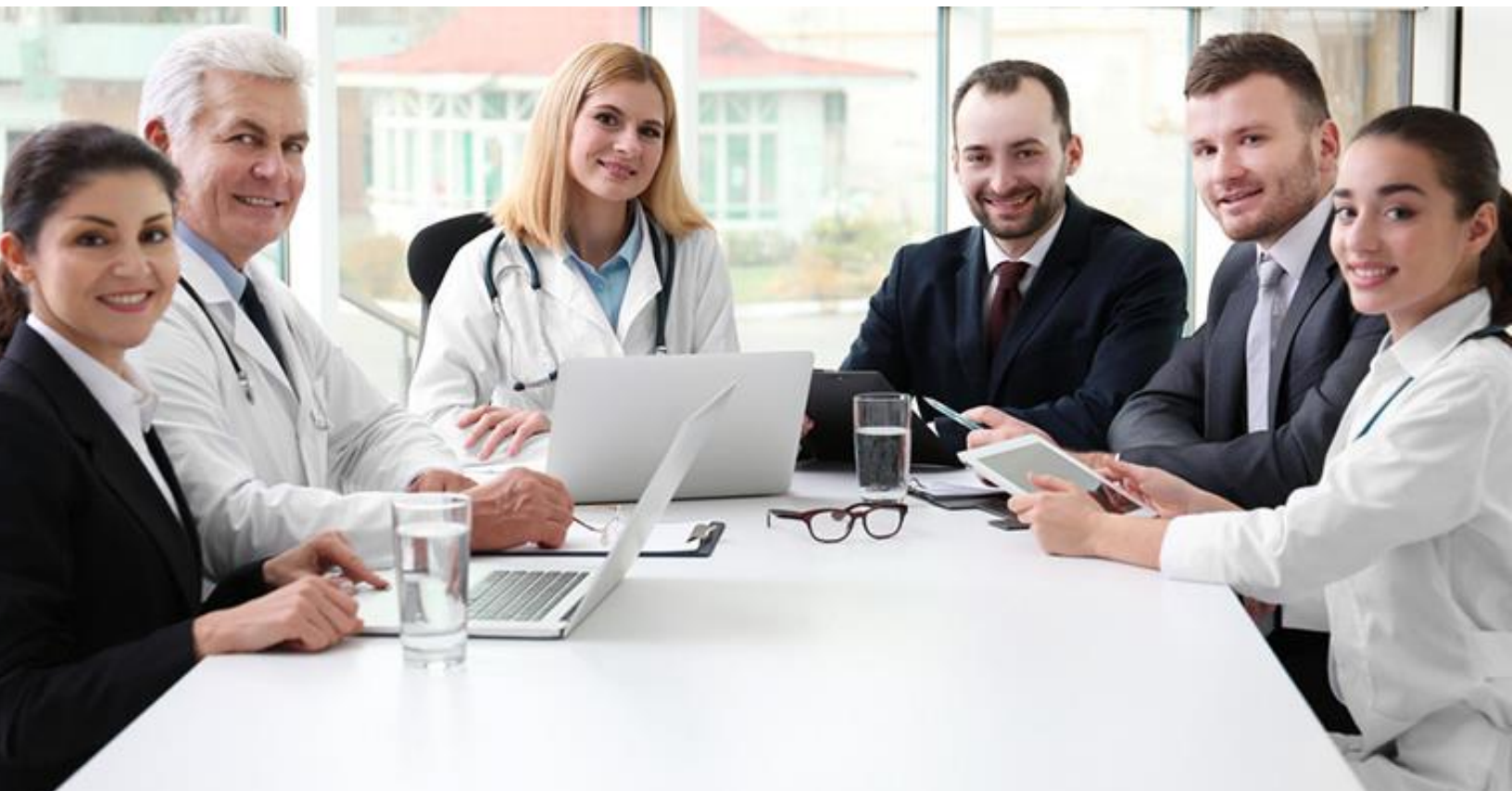
kander members of executive management and the board