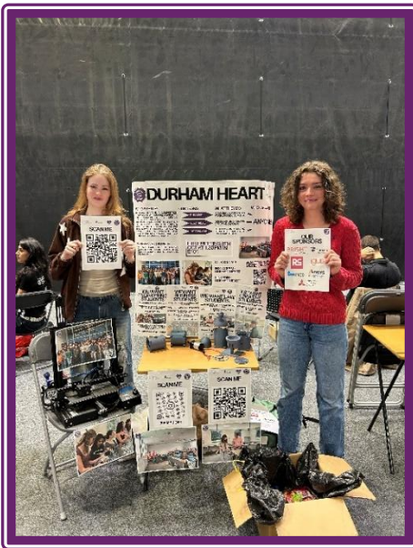
Members at the Freshers' Fair.