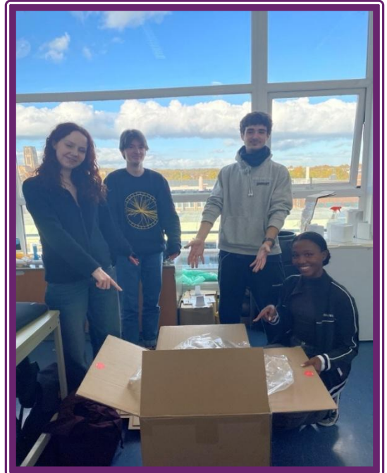
Unboxing the new valve testing supplies.

Our mechanical team have recently been working on 2 designs simultaneously. The new freshers on the team have been learning CAD to help with development of the hub and membranes; and research is being carried out on non-elastic biocompatible membranes. A compliance chamber is being designed and research on tubing that will be applicable for our design has begun.