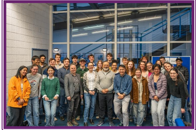
Group photo from our first team event.

We'd like to welcome you to the first Durham Heart Newsletter! This has been an exciting month for us as we have significantly grown in members across all of our teams following success from the Freshers' Fair. We are delighted to now be a team of 70!