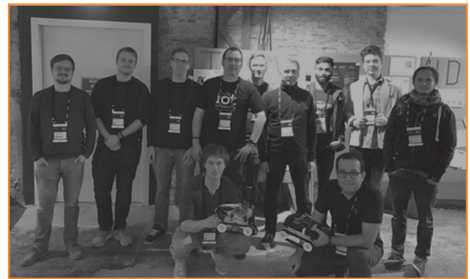
Members of the Eclipse Kuksa project team

Today, vehicle manufacturers and automotive suppliers take different, proprietary approaches to in-vehicle and internet connections.