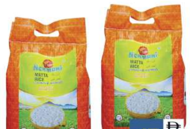
NENMANI PALAKKADAN MATTa RICE 5KG