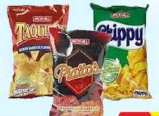
JACK N JILL CHIPS 85GM ASSRTD