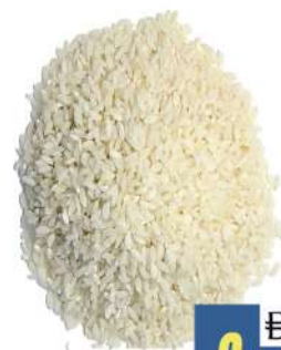
JEERAKASALA RICE KG