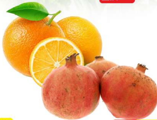
ORANGE VALENCIA OR ANAR MASRI KG