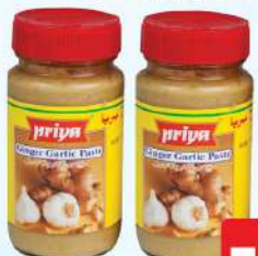
PRIYA GINGER & GARLIC PASTE 300GM