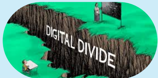
Impact of the Digital Divide: Economic, Social, and Educational Consequences