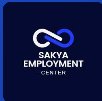
Sakya PVT LTD