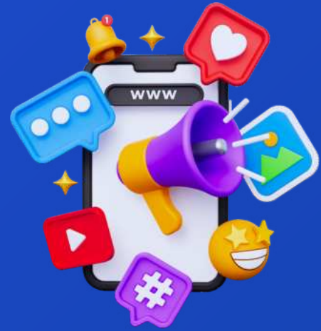
Social Media Handling