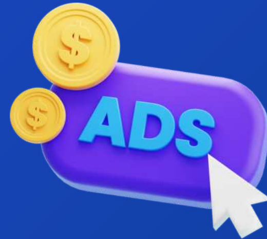
Paid Media (Meta, Tiktok, SEO)