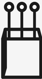
17 V2 Network Spread 5 traces fanning outward