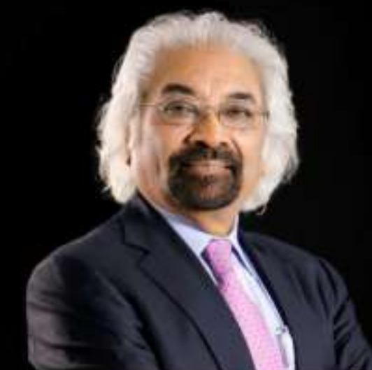
Dr. Sam Pitroda