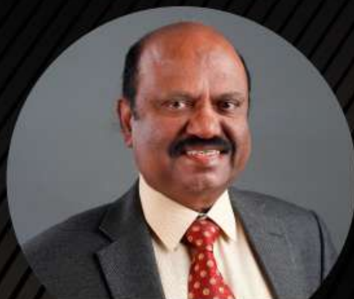
Dr. C. V. Ananda Bose