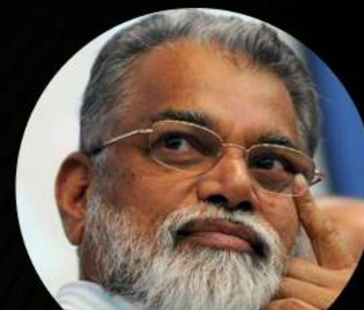
Dr. K Radhakrishnan