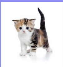
A cute kitty cat!

Without any further adoo, I wish to present you my image gallery!