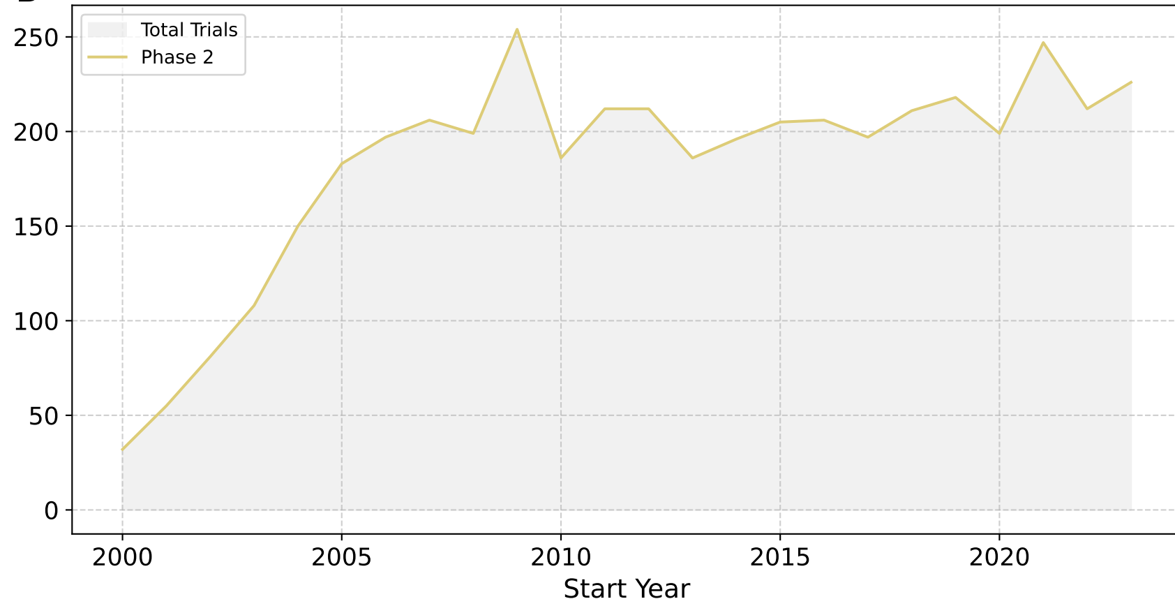
Count of Trials Started by Phase and Year