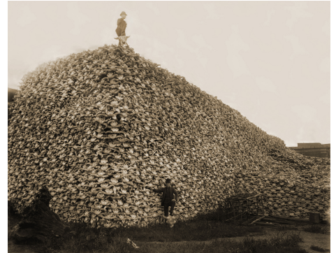
Bison skulls, ca. 1890.

Nullam feugiat euismod urna eu congue. Duis non aliquam dui. Orci varius natoque penatibus et magnis dis parturient montes, nascetur ridiculus mus. Nulla eget commodo dui. Vivamus mattis faucibus enim vitae tempus. Nam tincidunt purus dui, faucibus malesuada elit facilisis et. Ut commodo quis lectus sit.