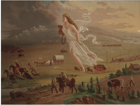
George A. Croft, "American Progress," ca. 1873. Chromolithograph after an 1872 oil painting by John Gast, courtesy of the Library of Congress, LC-DIG-ppmsca-09855

Lorem ipsum dolor sit amet, consectetur adipiscing elit. Nam porttitor, urna et suscipit tristique, tortor magna dapibus enim, vitae mollis justo ante ut justo. Ut nec lorem euismod, tincidunt lacus eget, ornare est. Duis mauris nisl, vehicula nec ultricies ut, elementum sit amet arcu.