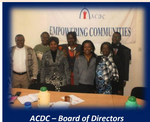
ACDC – Board of Directors