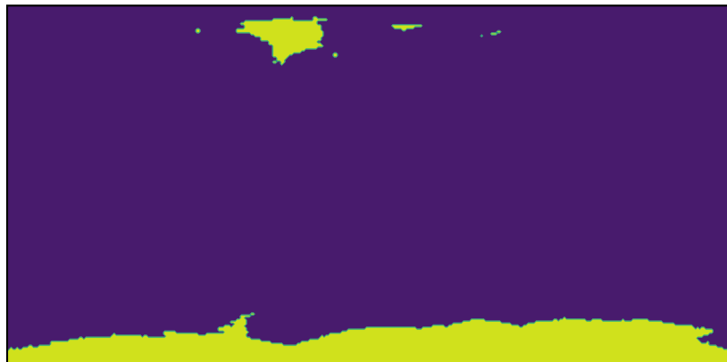
a) ice in pliocene or preindustrial