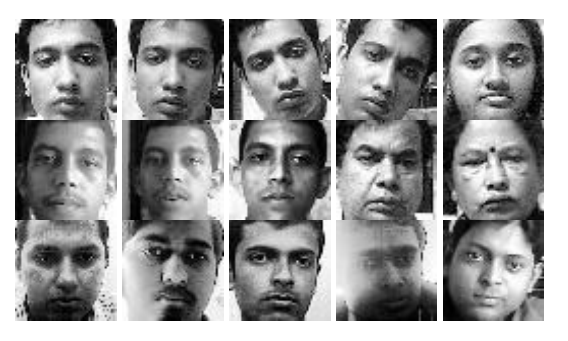
Fig. 3. Training Images