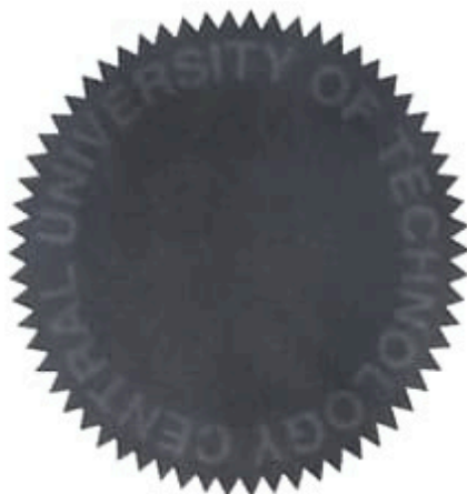
Vice-Chancellor and Principal