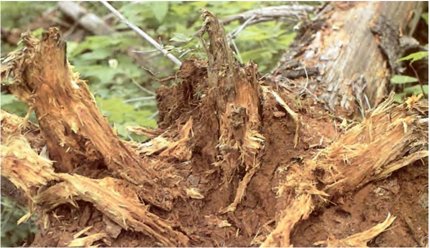
Figure 9 — Wood of Douglas-fir in advanced stages of decay is light yellow and stringy.