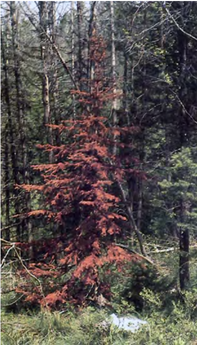
Figure 2 —This subalpine fir was killed rapidly and retained its full complement of needles.

predisposing them to attacks by other fungi or insects. Such behavior typically occurs in the relatively dry, inland coniferous forests of the Western United States.