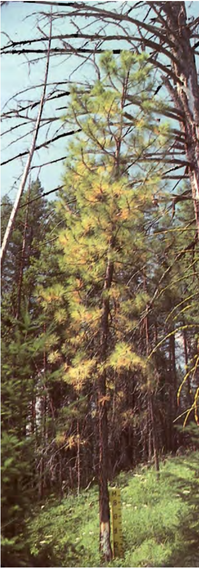
Figure 3 —Crown symptoms alone, such as those on this ponderosa pine, are not sufficient to identify the presence of Armillaria .