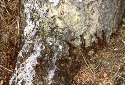
Figure 5 —Resin on a Douglas-fir. The first resin produced in response to the fungi turns dark brown but later is often covered with resin that retains a white sheen.

Trees affected by prolonged drought or attacked by rodents, bark beetles, or other fungi, particularly other root pathogens, can produce crown symptoms similar to those caused by Armillaria . Thus, additional evidence, often found on