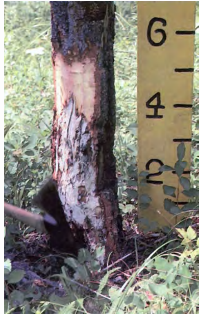
Figure 4 —Removing the bark at the base of the symptomatic ponderosa pine in figure 3 reveals the characteristic mycelial fans.

Because these fungi commonly inhabit roots, their detection is difficult unless characteristic mushrooms are produced around the base of the tree or symptoms become ob-