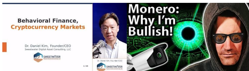
Monero Community Workgroup: "Behavioral Finance, Cryptocurrency Markets" 1:01:05

Monero is the gold standard in private digital payments . Monero a decentralized, permissionless cryptocurrency that allows for secure payments to anywhere in the world without the use of an intermediary. Want a quick intro? Consider these popular videos: