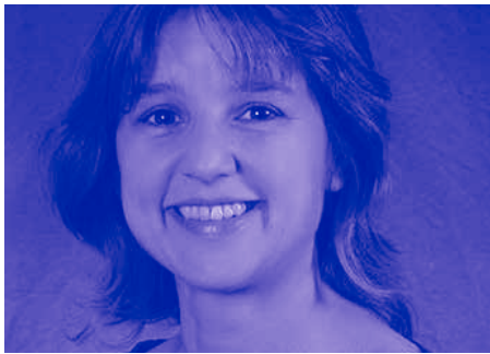
ZEYNEP TUFEKCI / @ZEYNEP

Professor, University of North Carolina. Writer, New York Times On Digital Inclusion and Decentralization