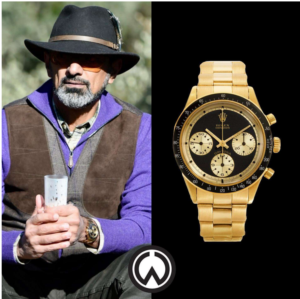
رندي ساعة رولكس دايتونا "بول نيومان" النادرة للغاية والعتيقة من الذهب الأصفر عيار ١٤ قيراط،