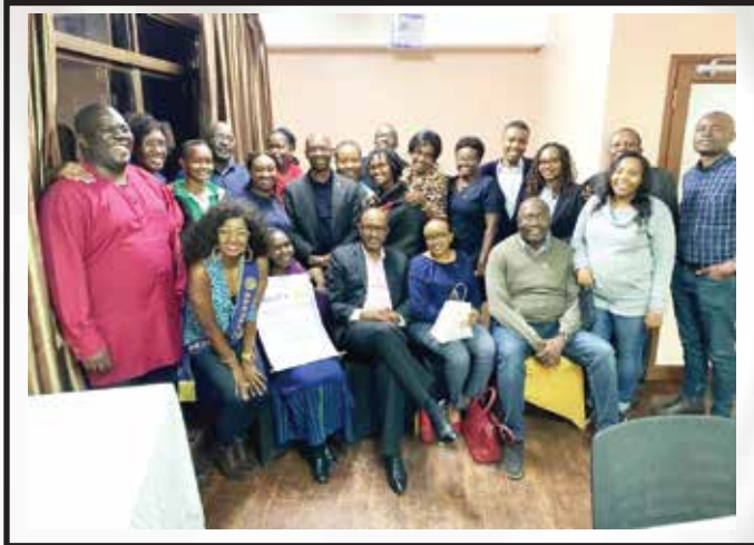
Rotary Club of Syokimau

Her sense of style began early. As a baby, she would confidently toddle around in her mother's and aunties' high heels — as if she already knew that fashion would one day be part of her signature. No wonder she became a shoe lover, a true high-heels girl from the beginning.