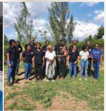
During her Graduation