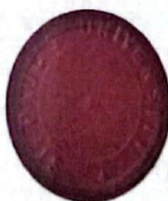
DEPUTY VICE-CHANCELLOR (ACADEMIC AFFAIRS)