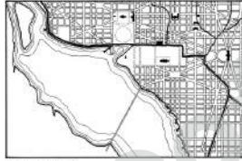
CITY OF WASHINGTON 1855

THE LOCKKEEPER'S HOUSE AT 17 TH STREET AND CONSTITUTION AVENUE SERVED THE LOCK THAT CONNECTED THE WASHINGTON BRANCH OF THE CHESAPEAKE AND OHIO CANAL TO THE WASHINGTON CITY CANAL THAT CROSSED THE CAPITAL CITY PARALLEL TO THE NATIONAL MALL. THE CITY CANAL SUFFERED PROBLEMS FROM ITS INCEPTION, AND ULTIMATELY BECAME AN OPEN SEWER. THE C & O CANAL ENTAILED ENORMOUS NATIONAL INVESTMENT BUT FELL VICTIM TO LABOR RIOTS, FLOODS, PESTILENCE, RIGHT-OF-WAY DISPUTES, AND FINALLY COMPETITION OF RAILROADS. THE RESULT FOR THE LOCKKEEPER'S HOUSE WAS THE FILLING-IN OF THE WASHINGTON BRANCH OF THE C & O CANAL AND THE WASHINGTON CITY CANAL, LEAVING IT REMOVED FROM ITS PURPOSE. THE HOUSE WAS FURTHER ISOLATED FROM THE RIVER WITH THE MAJOR LANDFILL AND RECLAMATION PROJECT OF THE TURN OF THE CENTURY THAT CREATED POTOMAC PARK, THE SITE OF THE LINCOLN MEMORIAL AND REFLECTING POOL. IT SERVED FOR A TIME AS A SQUATTERS' TENEMENT, AND LATER FOR THE PARK POLICE WITH A HOLDING CELL. AFTER WORLD WAR II THE HOUSE BECAME A COMFORT STATION, BUT NOW STANDS ABANDONED EXCEPT FOR SOME USE AS STORAGE FOR GROUNDKEEPERS. FEW VISITORS TO THE PARK CAN VISUALIZE THE HISTORIC SCENE OF CANAL BARGES PASSING BY THE FOOT OF THE ELLIPSE AND DOCKING AT THE WHARF THAT ONCE EXTENDED TO THE SOUTH OF THE HOUSE, NOR THE IMAGE OF THE POTOMAC RIVER EXTENDING NEARLY TO THE BASE OF THE WASHINGTON MONUMENT. THE LOCKKEEPER'S HOUSE STANDS AS TESTIMONY TO THIS DRAMATIC AND EVENTFUL PAST.