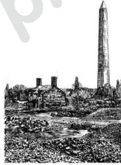
AFTER DESTRUCTION OF THE CANAL 1890'S

17 TH STREET & CONSTITUTION AVENUE WASHINGTON, D.C. Ca. 1832