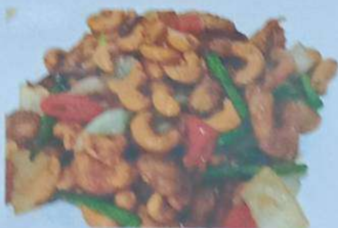
Stir Fried with Cashew Nuts

Chicken, Pork or Beeef 95.- Prawns or Seafood 125.-