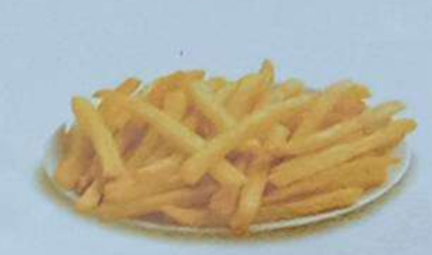
French Fries 65.-