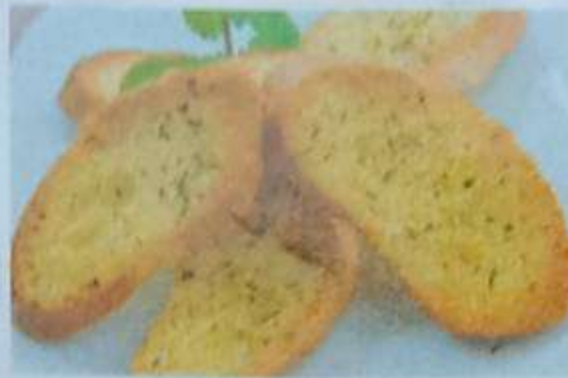
Garlic Bread 75.-