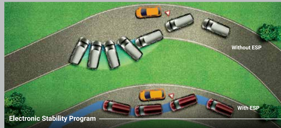
Electronic Stability Program

The S-PRESSO will keep you secure through every twist and turn with 11+ Safety features with Hill Hold Assist