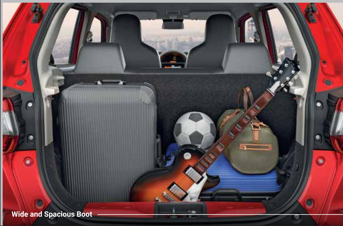
Wide and Spacious Boot

Open the doors and the S-PRESSO simply invites you to a world of never-ending excitement. All thanks to the commanding high-view seating that lets you scope the fun around you. Plus, its Dynamic Center Console, first-in-its-class Steering-Mounted Audio and Voice Controls and swanky colour accents make you feel alive, even before you drive out.