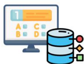
External Exam record Management