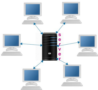
LAN Connection Available

Software helps manage Student, Teacher, Courses, Batches, Fees, Attendance, and Marks. Software provides easy reports like outstanding fees, Marks, Attendance etc. This is a must have software for all coaching institutes. For quite some time we have been asked by several institutes to develop software that is focused on coaching institute requirements. CIMS is developed after collecting requirements from several institutes in different fields. The product is very easy to use and it is developed with the consideration that the operators who are not familiar with using computers should also be able to use it easily.