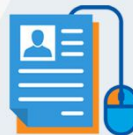
Student Registration Management