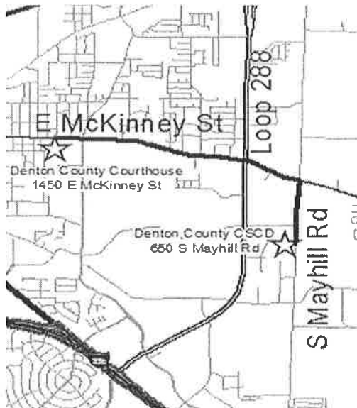
Map to Adult Community Supervision