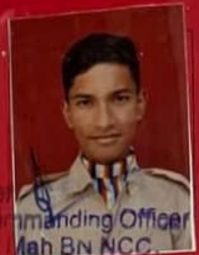
Commanding Officer 22 Mah BN NCC, Satara