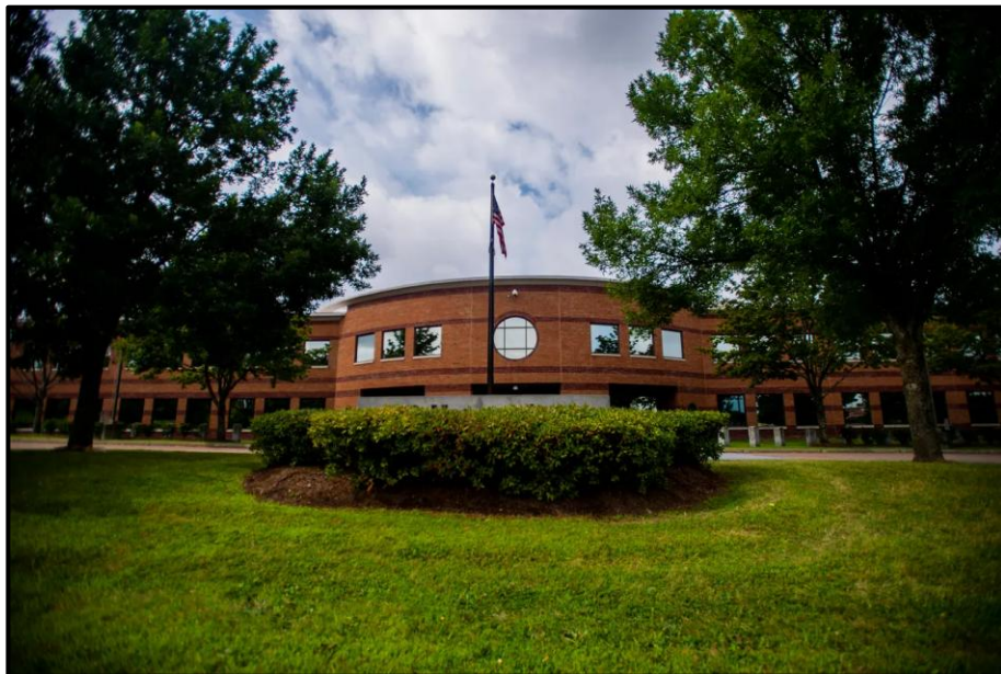
Photo of 188 Harvest Lane, Williston, Vermont

Note: The previous owner, Pizzigalli Properties LLC, is still listed as the owner on the Williston town record database. 1