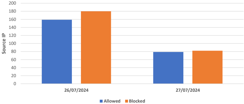
'Source IP' by 'Time' and 'Action'