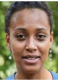
Author B (Senior Member, ICCK) received the B.S. degree in software engineering from University of Pennsylvania, PA 19104, USA, in 2012. (Email: email@email.com)