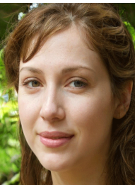
Author A (Member, ICCK) received the B.S. degree in software engineering from University of Pennsylvania, PA 19104, USA, in 2012. (Email: email@email.com)