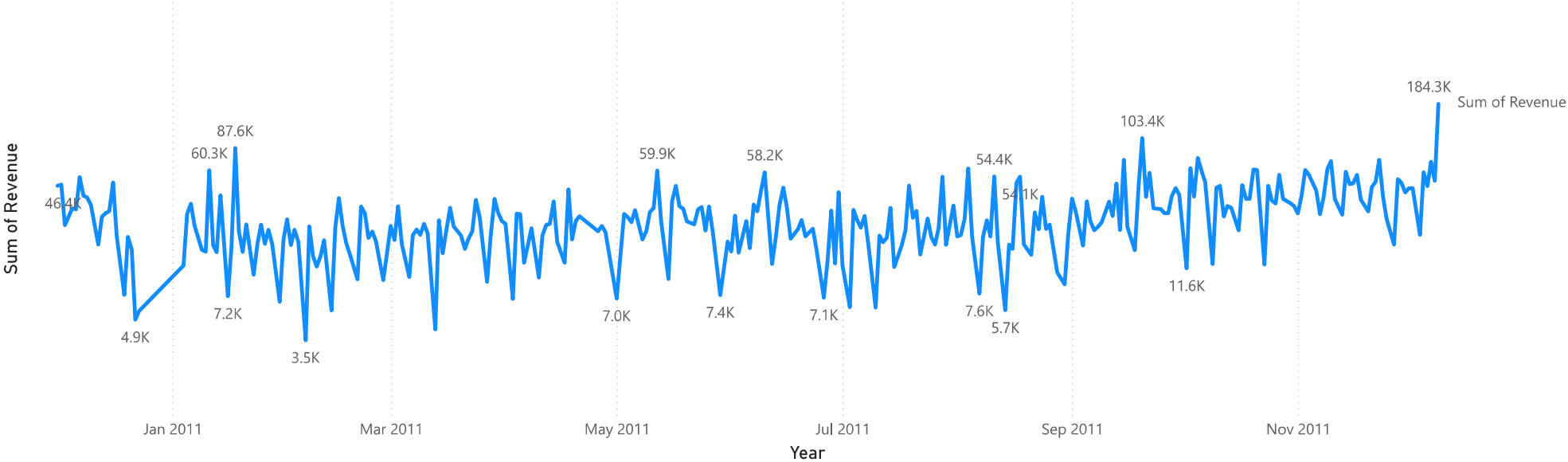
Sum of Revenue by Year, Quarter, Month and Day