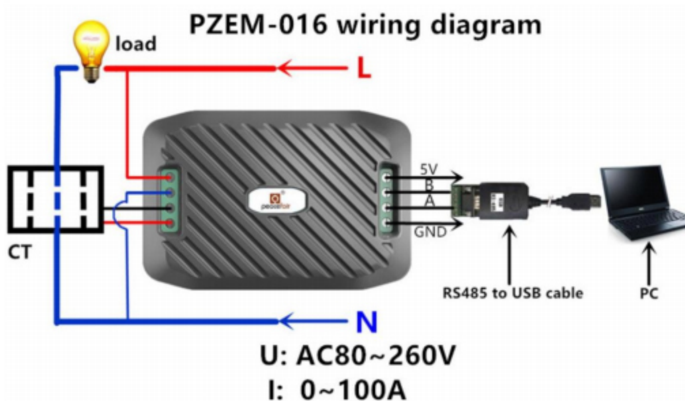
Picture 4.2 PZEM-016 wiring diagram