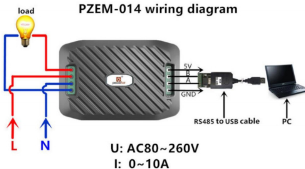
Picture 4.1 PZEM-014 wiring diagram