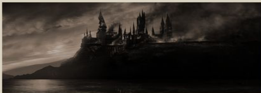
HOGWARTS SCHOOL OF WITCHCRAFT AND WIZARDRY LEFT IN RUINS AFTER DEATH EATER ATTACK.

Reports from Hogwarts School of Witchcraft and Wizardry have been confirmed to be true: the Dark Lord, He-Who-Must-Not-Be-Named, Lord Voldemort, has been defeated once and for all, by Harry Potter.