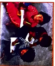
Learning Today... Leading Tomorrow

In the Paatshaala program more than 50 children have been admitted to formal schools, furthermore they are also tutored by the members so to cope up with the lost time and also to gain a better edge. The Team plans to setup various Study Center's and cater approx. 300 children. Team also plans to provide Scholarship benefits to deserving candidates.