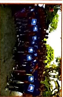
Run For Health - Marathon 2014