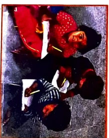
Learning Today... Leading Tomorrow

In the Paatshaala program more than 50 children have been admitted to formal schools, furthermore they are also tutored by the members so to cope up with the lost time and also to gain a better edge. The Team plans to setup various Study Center's and cater approx. 300 children. Team also plans to provide Scholarship benefits to deserving candidates.