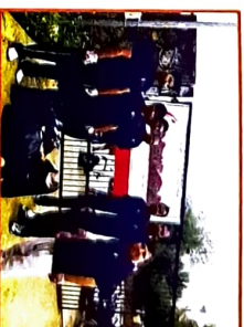
Paryavaran - My Locality I Care - Cleanliness & Awareness Drive

This program has been initiated to inculcate a sense of responsibility as well as civic sense among the residents. As part of this initiative almost every weekend CIN members along with volunteers visit various parks and other public places to conduct a cleanliness drive. Beside cleaning parks, Members converse with the morning walkers and children to make them aware and take notes/suggestion as to how the area can be improved. The suggestions are compiled, sent and followed up with the proper authorities.