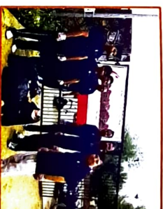
Paryavaran - My Locality I Care - Cleanliness & Awareness Drive

This program has been initiated to inculcate a sense of responsibility as well as civic sense among the residents. As part of this initiative almost every weekend CIN members along with volunteers visit various parks and other public places to conduct a cleanliness drive. Beside cleaning parks, Members converse with the morning walkers and children to make them aware and take notes/suggestion as to how the area can be improved. The suggestions are compiled, sent and followed up with the proper authorities.