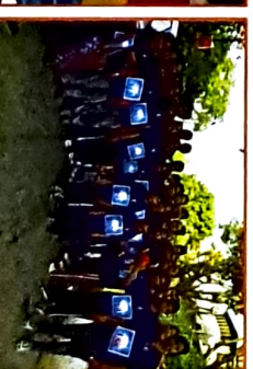
Run For Health - Marathon 2014