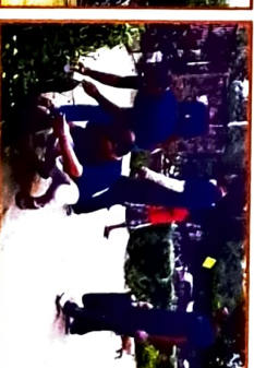
Paryavaran - My Locality I Care - Cleanliness Drive

Perfect Health - As part of Perfect Health, Change I Network has been raising awareness through various health camps, blood donation camps, eye checkup, etc.