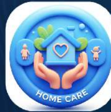
Home Care Services