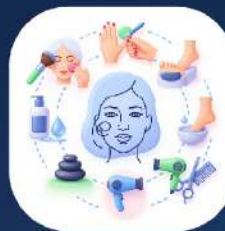
Beauty & Body Treatments