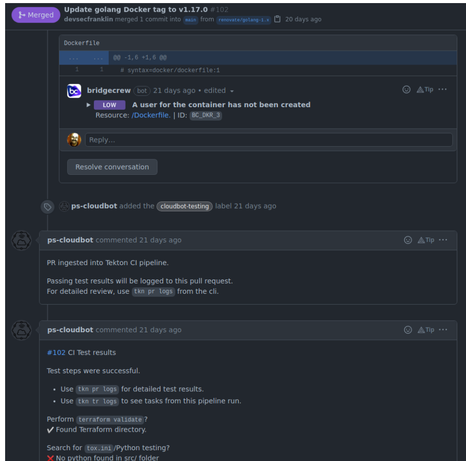
Figure 3: Bridgecrew integration with pull request automation

In addition to the ability to scan for dependencies which are out of date or have vulnerabilities of note, we can perform automated security scanning of the code base as seen in figure 3. As before, the Renovate bot has detected the use of an out of date Docker base image for Golang. Because the Dockerfile is updated as part of this pull request, Bridgecrew scans the file and triggers on misconfigurations that may lead to security issues. The results of the scans and the issues are noted in the pull request comments. Automated remediation and merging of these issues may be possible in some cases.