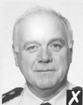
flash reflection on skin