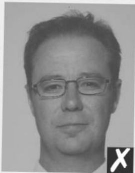
washed out colour