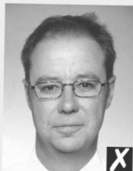
unnatural skin tones