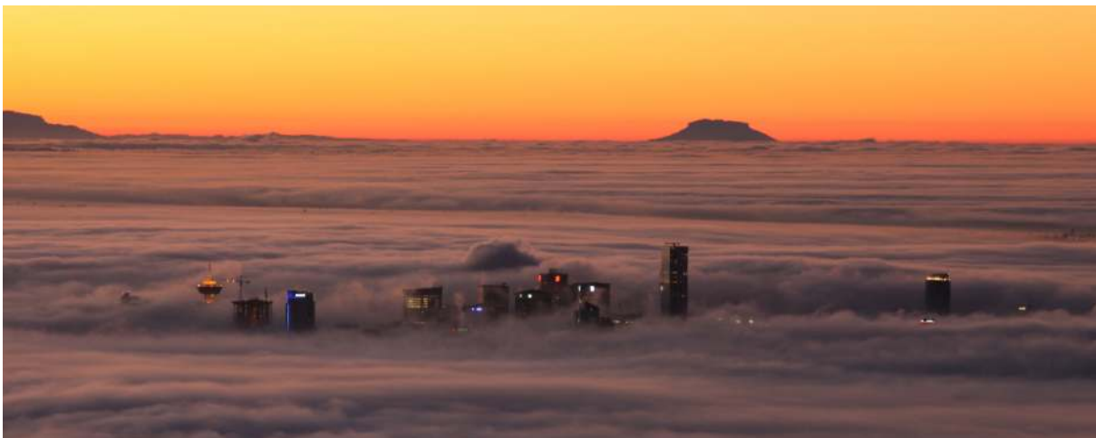
Figure 1: In the Clouds: Vancouver from Cypress Mountain.

Martha Stewart‡ Martha Stewart Enterprises Microsoft Research