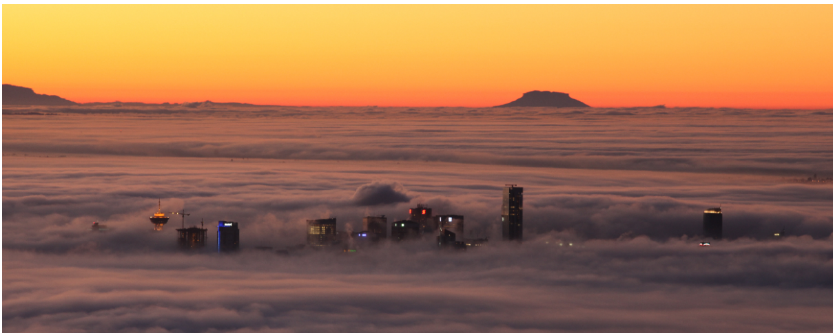
Figure 1: In the Clouds: Vancouver from Cypress Mountain.