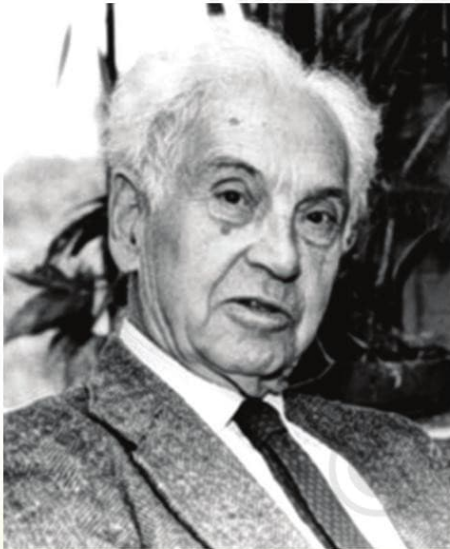
Ernst Mayr (1904 – 2004)

Born on 5 July 1904, in Kempten, Germany, ERNST MAYR, the Harvard University evolutionary biologist who has been called 'The Darwin of the 20 th century', was one of the 100 greatest scientists of all time. Mayr joined Harvard's Faculty of Arts and Sciences in 1953 and retired in 1975, assuming the title Alexander Agassiz Professor of Zoology Emeritus . Throughout his nearly 80-year career, his research spanned ornithology, taxonomy, zoogeography, evolution, systematics, and the history and philosophy of biology. He almost single-handedly made the origin of species diversity the central question of evolutionary biology that it is today. He also pioneered the currently accepted definition of a biological species. Mayr was awarded the three prizes widely regarded as the triple crown of biology: the Balzan Prize in 1983, the International Prize for Biology in 1994, and the Crafoord Prize in 1999. Mayr died at the age of 100 in the year 2004.