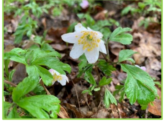
Wood Anemone (Anemone nemorosa)

The return each year of these woodland flowers is an important part of the woodland habitat.