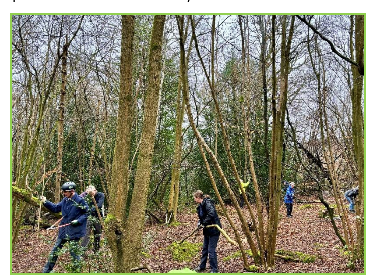
January and February volunteer sessions this year, in Ashenground Wood near the village school, here the volunteers are busy coppicing.

You may have seen the volunteers coppicing in the first two months of this year on the regular Saturday sessions. Originally, woodland was coppiced to produce a fast-growing, reliable supply of timber for poles, stakes and wood crafted products, also as a fuel source for iron smelting (Wealden geology consists of clays and sands that provided the iron ore). Today, woods are coppiced not only to provide a reliable source of timber, especially from Hornbeam, Hazel and Sweet Chestnut trees, but to also allow sunlight to reach across the woodland floor and help woodland plants flourish, enriching this precious habitat's biodiversity.