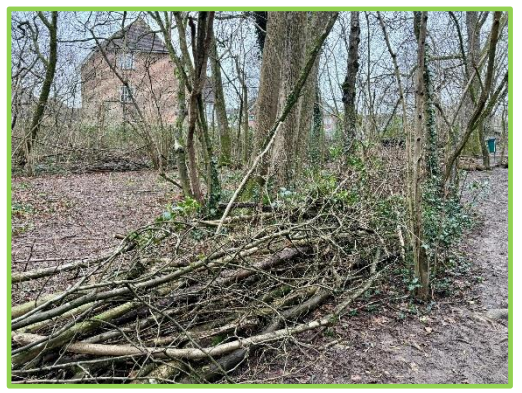
After edging the path with coppicing

Partrick Burke in the photo above is explaining the techniques of how and why we coppice. We laid the coppicing along the path edge to encourage people to keep to the main paths thereby protecting the wildflowers.