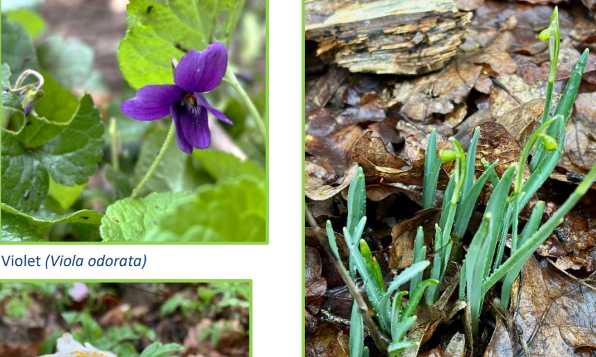
Snowdrops (Galanthus nivalis) in bud