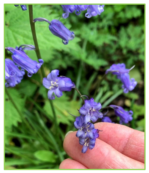
English Bluebells (Hyacinthoides non-scripta)

In April and early May the bluebells open up, with their serene violetblue flowers, not only beautiful to see, if it is warm you will be able to smell a sweet scent and like the wood anemones they provide a great food source for bees.