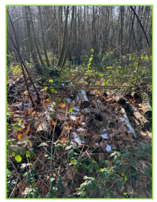
Regenerating chestnut coppice in Catts Wood. Note the habitat pile of old cut 'poles' S. Meier

In an attempt to improve biodiversity, a special project (initiated by FOABW) translocated the more biodiverse topsoils from the school construction site to Catts Wood. The benefit of the project can only be assessed in the very long term, so let's see how it is in another ten years' time!