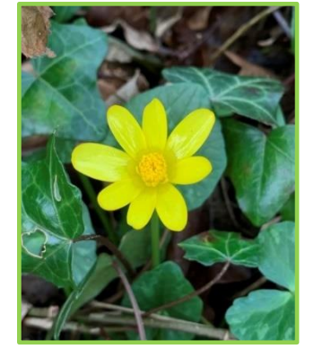
Lesser Celandine (Ficaria verna)