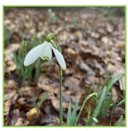
Snowdrop (Galanthus nivalis)