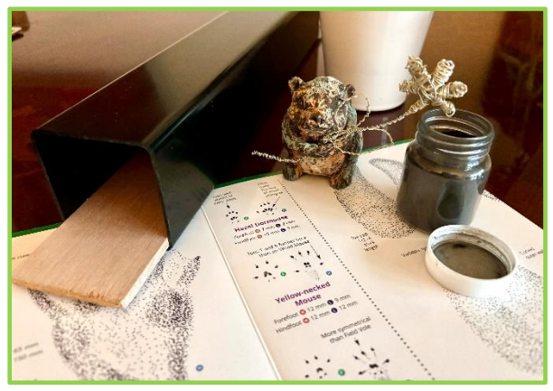
Survey tunnel, charcoal to make ink, mammal track guide

Ancient woodland offers an ideal habitat for dormice to eat, sleep, rest and play. They hibernate from October to April, then as spring gets underway they will forage nocturnally in glades, coppiced areas and hedgerows in the woods. Although they are protected in the UK, sadly their decline continues, a recent study by the People's Trust for Endangered Species (PTES) found that they have disappeared from 20 counties in England, with the South East as one of the few areas where they are still to be found. In the spring, volunteers are going to place a number of survey tunnels with ink in each entrance, so that if any small mammal passes through, their paw tracks will be marked. Little dormice feet are only 7-10mm in length, we hope to see their tracks, more information in the next newsletter.