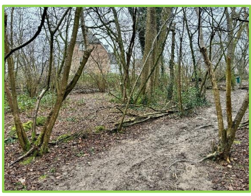
Path edge before coppiced wood is laid