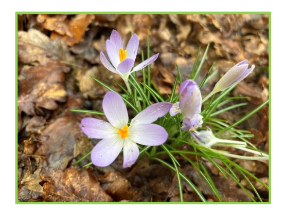
Crocus (Crocus tommasinianus)