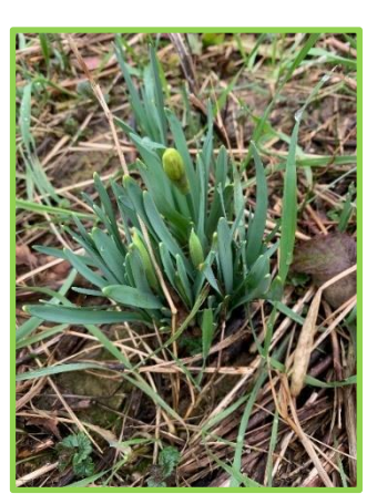
Daffodil (Narcissus pseudonarcissus) in bud