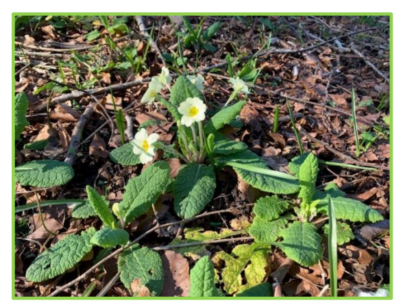
Primrose (Primula vulgaris)

Spring flowers make the most of the sunlight that reaches the woodland floor, before the budding leaves on the trees begin to shade the ground. From the first early primroses, snowdrops and daffodils, followed by the deep yellow lesser celandine and the delicate, white, star-shaped wood anemone (an ancient woodland indicator plant), the woodland floor is dappled with yellow and cream colours as well as the lilac crocuses and deep purple violets.