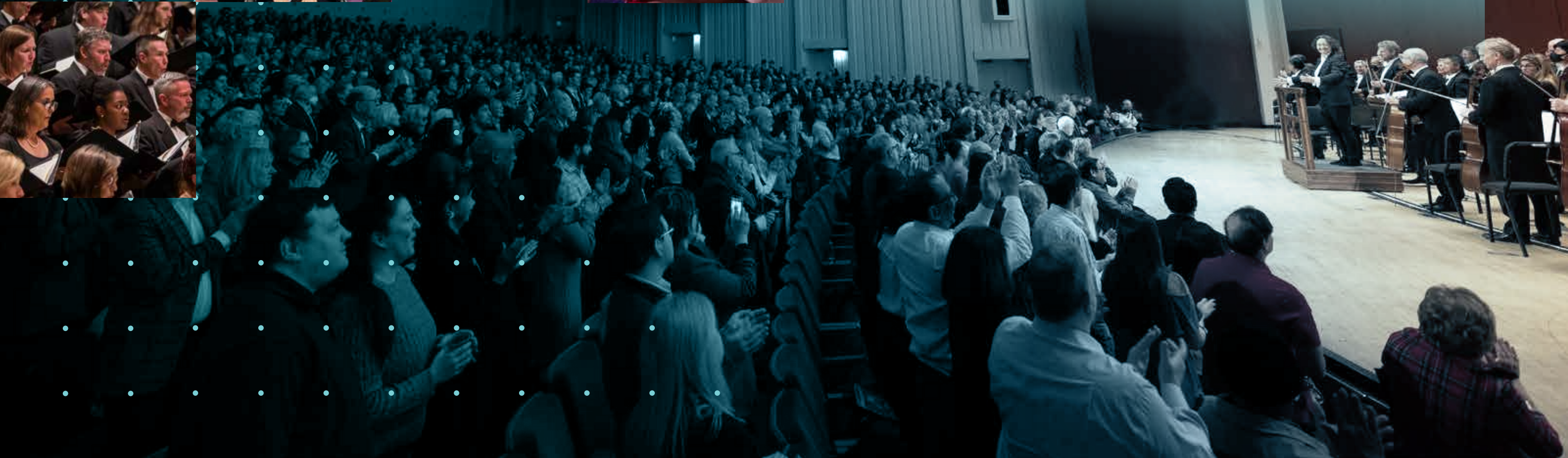
Nathalie Stutzmann Music Director