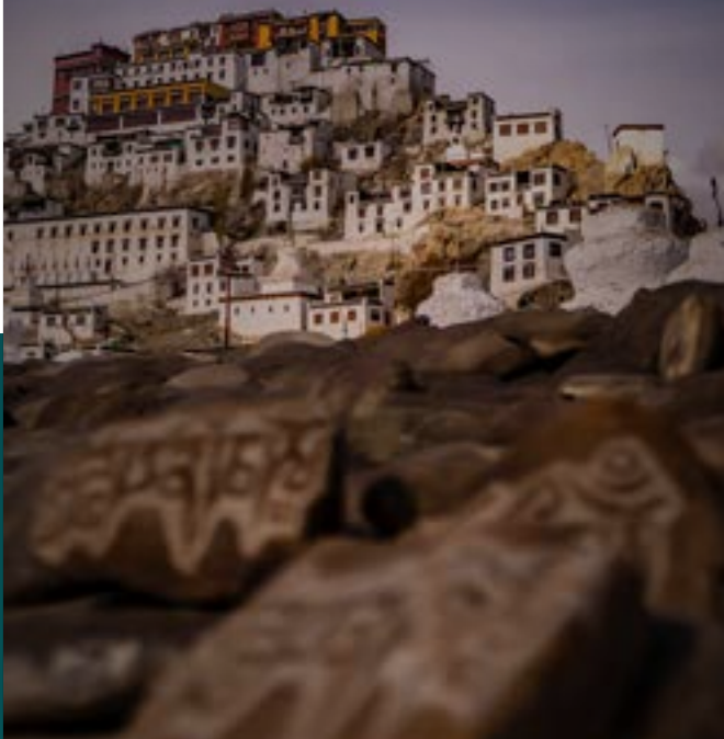
Image: Thiksey Monastery

As you explore the incredible Leh Ladakh biking adventure, you will encounter a variety of captivating destinations that showcase the region's natural beauty and cultural richness.