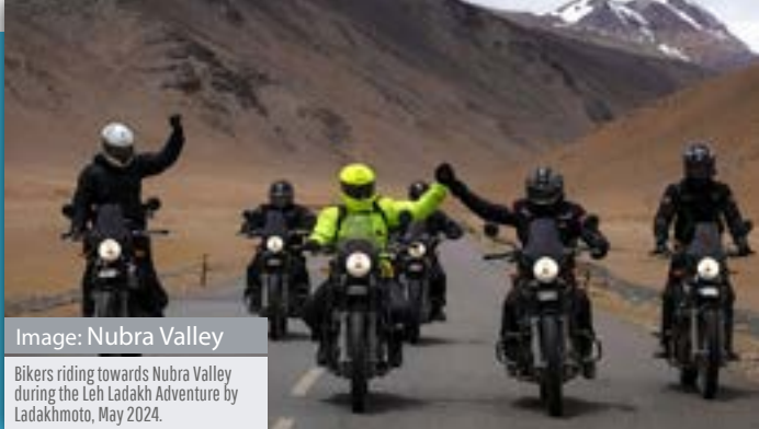
Image: Nubra Valley

Bikers riding towards Nubra Valley during the Leh Ladakh Adventure by Ladakhmoto, May 2024.